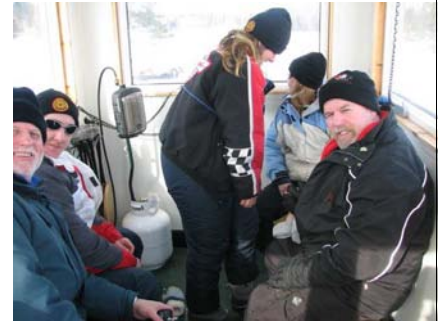
or... "Chalet Bunnies" ?