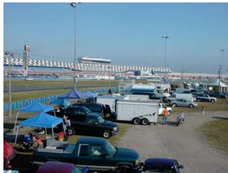
Grandstands & infield