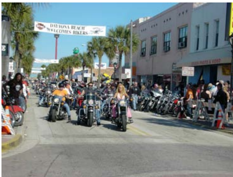
The famed Main St