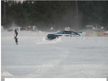
Coming or going?