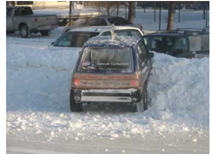
Bumper reads, "Driver powered by beans & cabbage."