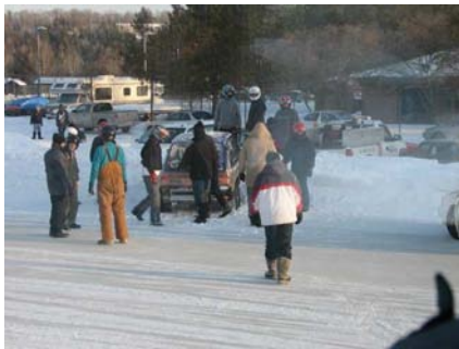
Everyone lends a hand pushing out